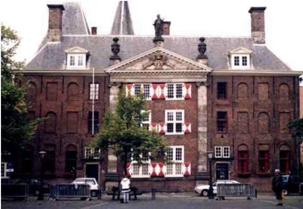
Former courthouse 'Gravensteen', Leiden.

The two chimneys of the former courthouse 'Gravensteen' in Leiden carry two sundials each, so that no less than four sundials are to be seen here.