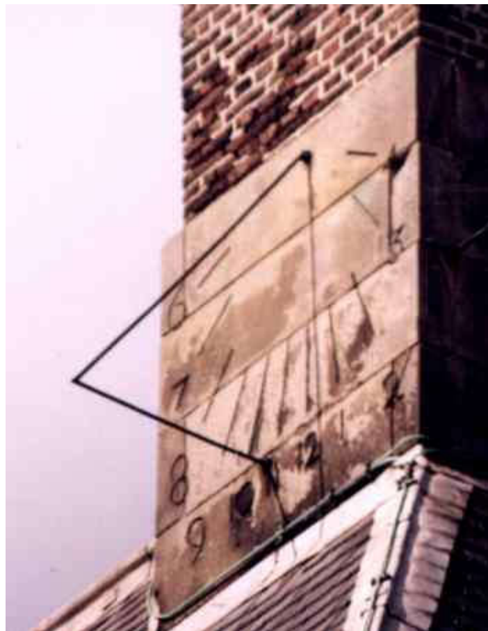
The other south dial.

The sundials were probably added in 1655, when the building was enlarged towards St. Peters Cemetery to get its current appearance.